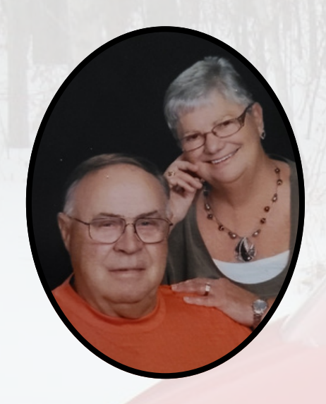
Close the Gate For this one farmer the worries are over, Lie down and rest your head, Your time has been and struggles enough, Put the tractor in the shed.

You always believed that the good Lord would provide And He always had somehow, Take off your gloves and put them down, No more sweat and worry for you now.