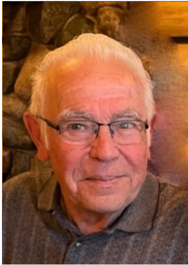
I Like Beer

[Verse 1] In some of my songs I have casually mentioned The fact that I like to drink beer This little song is more to the point Roll out the barrel and lend me your ears