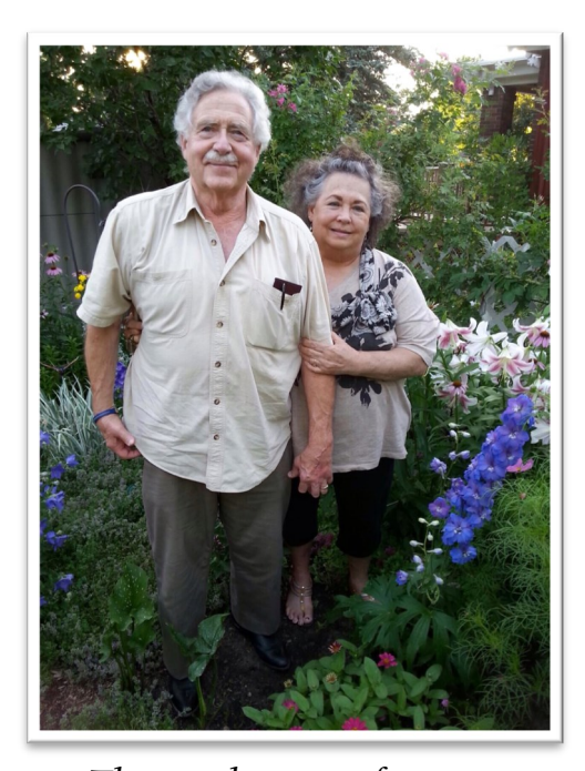
The time has come for me to leave this life. I have Fought the good fight I have finished the race. I have kept the faith. Now there is in store for me the crown of righteousness which the Lord, the righteous judge, will award to me on that day.